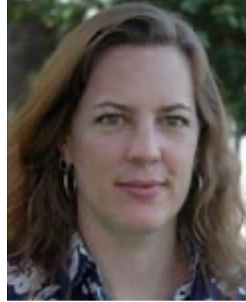
Betania Allen-Leigh National Institute of Public Health Mexico