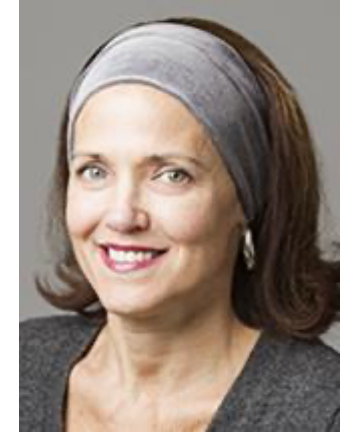
Maggie House National Cancer Institute